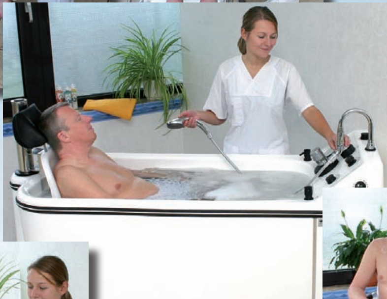
clearly arranged fittings